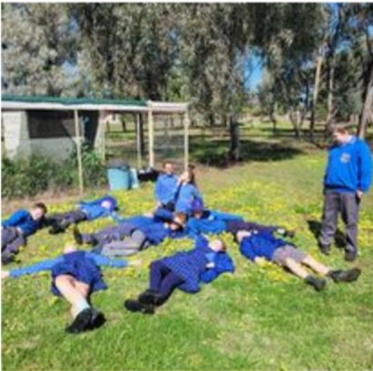
Primary Class laid in yellow flowers and enjoyed the sun.